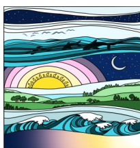
Caring for God's Creation