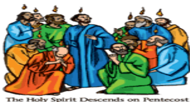
The Holy Spirit Descends on Pentecost