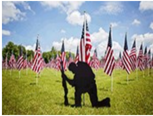
Veteran's Day, November 11

Next Monday our country celebrates Veteran's Day . How fitting that this weekend was selected for the national collection for the Archdiocese for the Military Services . This archdiocese, which was founded by Saint John Paul II, provides pastoral ministries to those serving in the Armed Services. Your donations will assist the Archdiocese as it provides the Gospel, the sacraments, and others forms of spiritual support to the men and women of the United States armed forces wherever they serve. As you display a flag next Monday, stop to say a prayer for those who serve our country so nobly. Aren't we grateful that our servicemen and women can bring their prayers, their fears, their uncertainties, and their hunger for the Eucharist to the table of the Lord at Mass? We are grateful for the Archdiocese that enables our soldiers and their families to receive the sacraments. Please consider making a generous contribution.