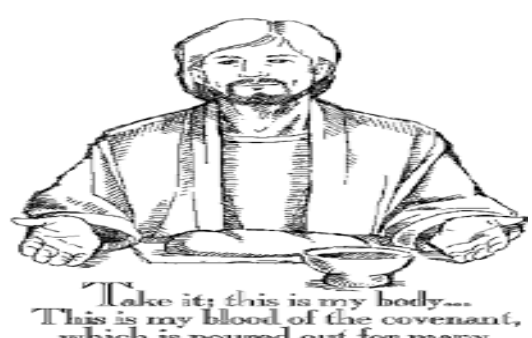
of tl e coven ourt fe Jark 14:22-24

Reflection: Do I receive the Eucharist each time with full reverence and awe?